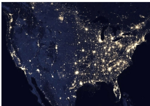
This image of the continental United States at night is a composite assembled from data acquired by the Suomi NPP satellite in April and October 2012.

With light pollution still on the rise, viewing the stars and the constellations is becoming more difficult. Many city dwellers have never seen a starry, night sky. As the population spreads into the