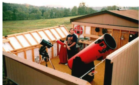
Club member observatory

C an you see through the street light's bright glare ?