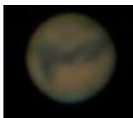
Photo of Mars