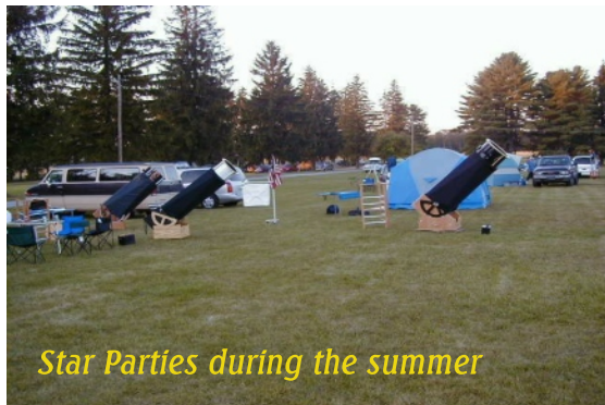
Star Parties during the summer