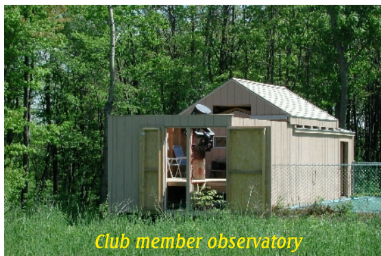
Club member observatory